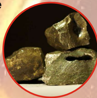
LC Ferro Manganese