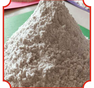
Boron Mix Ramming Mass