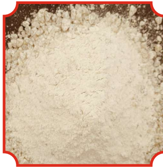
Quartzite Ramming Mass