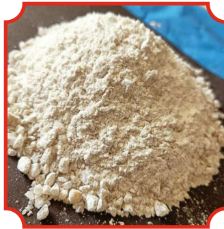
Quartz Ramming Mass