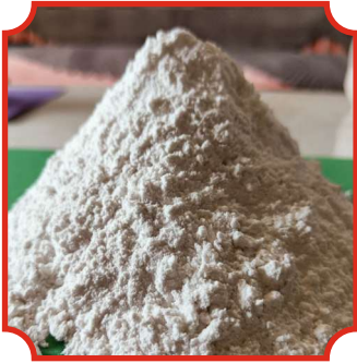
Premix ramming mass