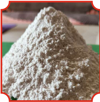
Acidic Ramming Mass