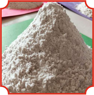
Ladle ramming mass